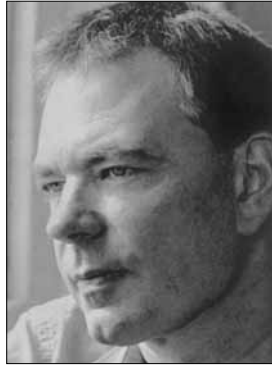
Julian Lloyd Webber

They join top artists, ranging from the Dufay Collective, the Orchestra of St John's, to pianist